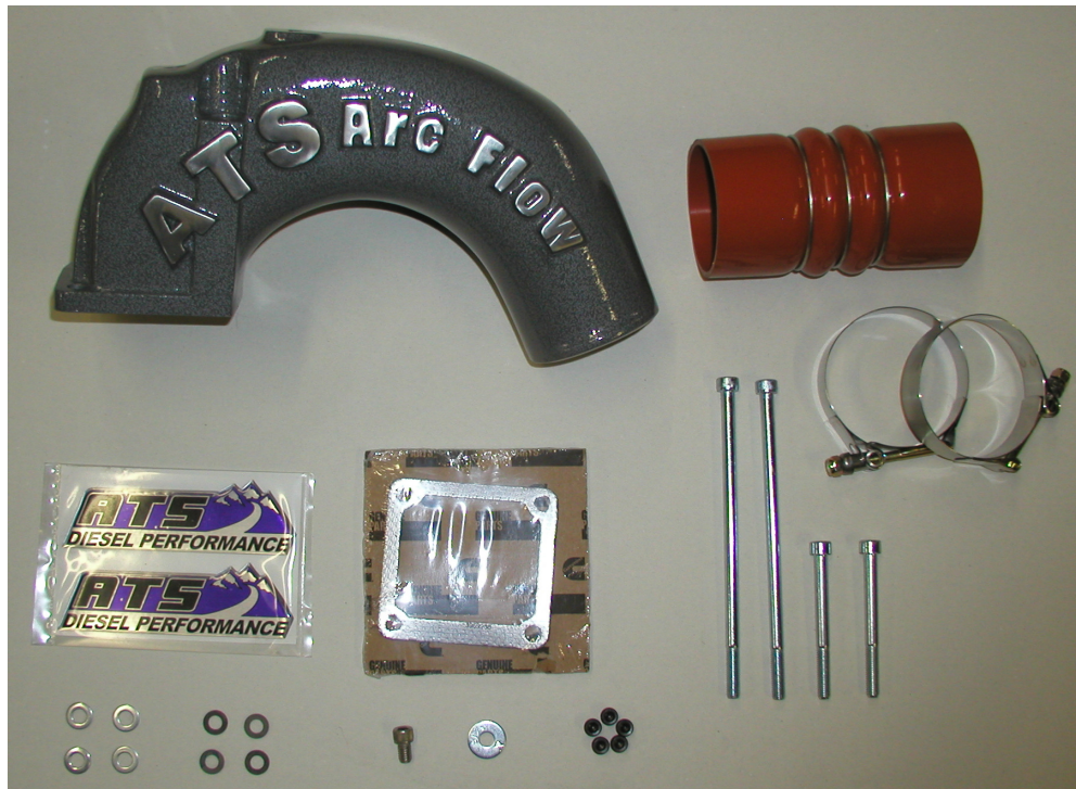
Figure 1 - CR Arc Flow Kit Contents

Thank you for purchasing the ATS Arc-flow Intake Manifold. This manual is to assist you with your installation. If installing for a customer, please pass this manual on to your customer for future reference.