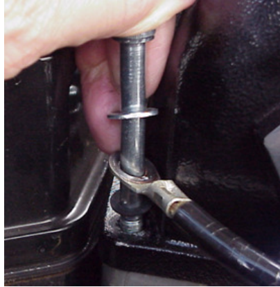
Figure 3 - Installing Ground Wire, Note Rubber Washer Below Ring Terminal