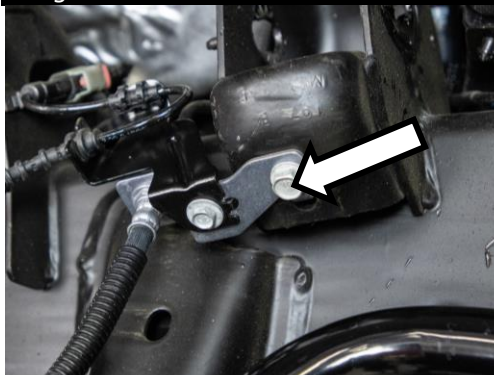
Figure 1: Remove Brake Line Bracket