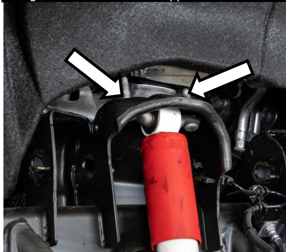
Figure 5: Remove Shock Upper Mount Nuts