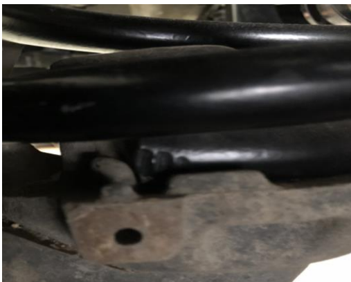
Figure 14B: Bottom Spring Pig-tail Orientation