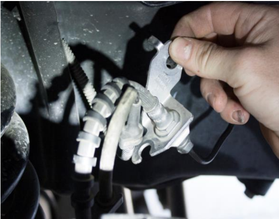
Figure 2A: Passenger ABS Line Removal