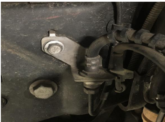
Figure 1A: OE Brake Line Bracket