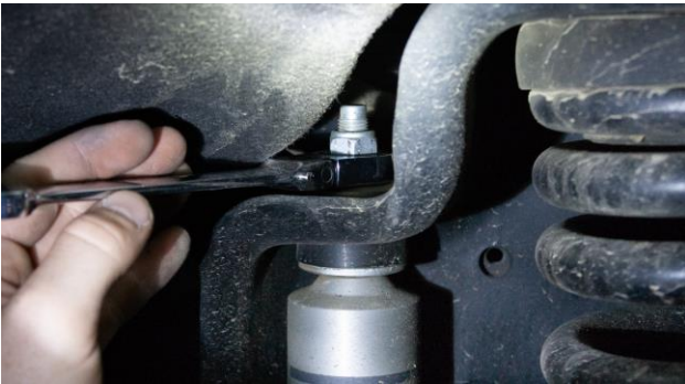
Figure 8A: Front Shock, Top Mount