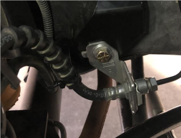
Figure 5: Driver Side ABS Line Installed