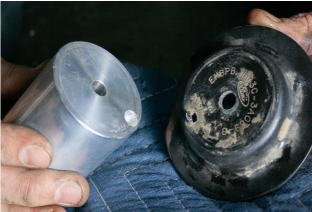
Figure 12: Bump Stop Spacer Alignment