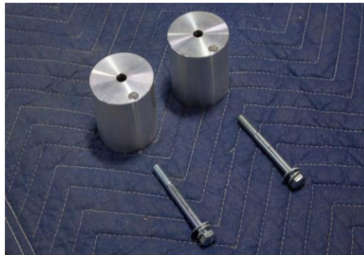
Figure 11: FSD Bump Stop Spacer Hardware