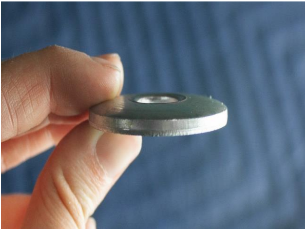
Figure 15A: Concave Shock Mounting Washer