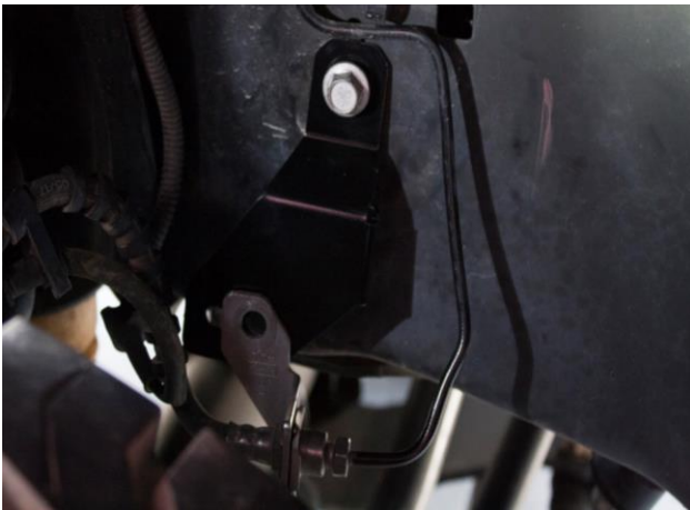
Figure 3: Passenger Brake Line Bracket