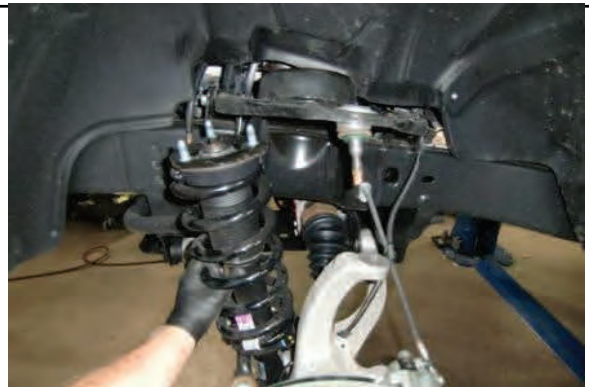
Then, lower strut out of frame and remove from vehicle.