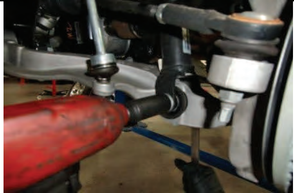
Remove lower strut mounting nut.