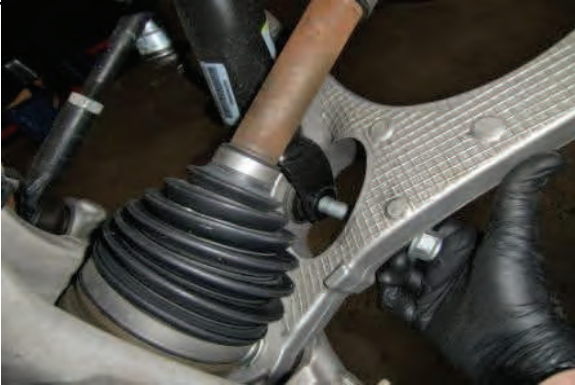
From opposite side remove bolt