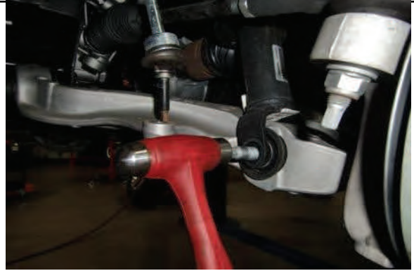
Gently tap lower strut mounting bolt out.