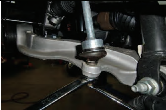
Loosen and remove lower sway bar nut.