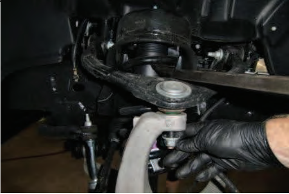
Using a pry bar, release tension, remove upper ball joint nut.