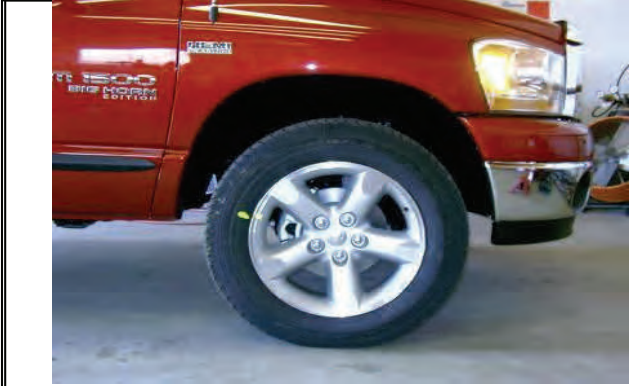
Place vehicle on level ground, lift and support properly.