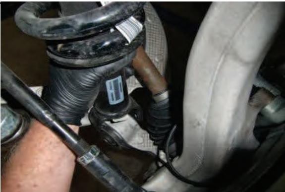
Push down suspension while lifting strut fork over lower arm.