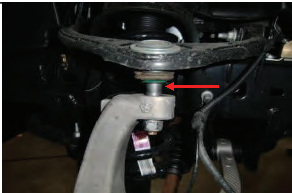
Picture shows separated upper ball joint. Note gap.