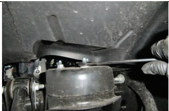
Now remove upper strut mounting nuts.