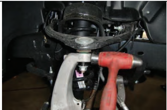
Carefully strike spindle to break upper ball joint loose.