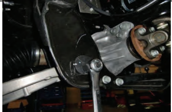
Mark and loosen front/rear lower control arm alignment cams