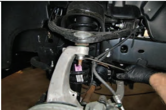
Loosen upper ball joint nut. Leave attached.