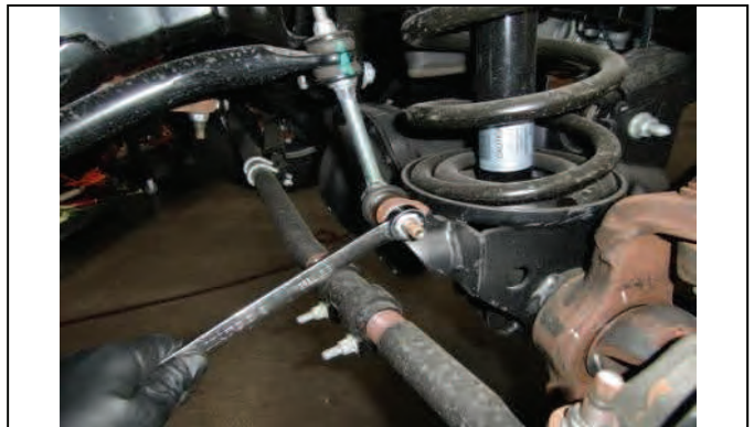
Disconnect pass/dr lower sway bar endlinks.