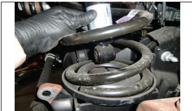
Slowly lower axle in order to remove shock and coil spring.