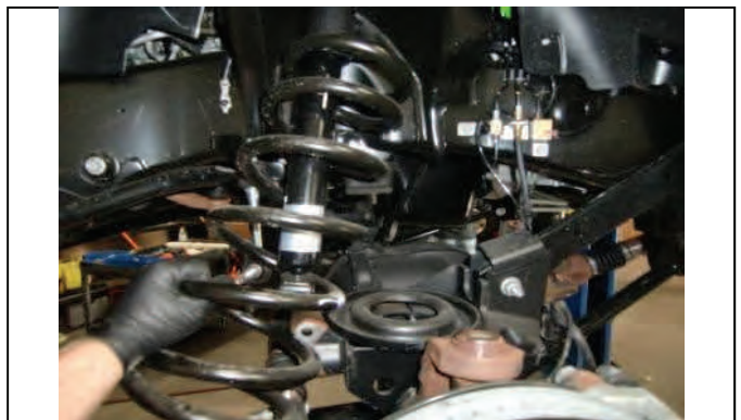
Remove spring towards the front of the vehicle.