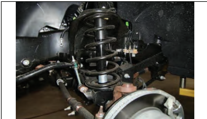
Picture of front suspension. Support front axle with jack.