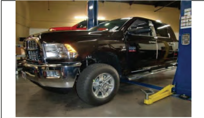
Raise and support front of vehicle on level ground.