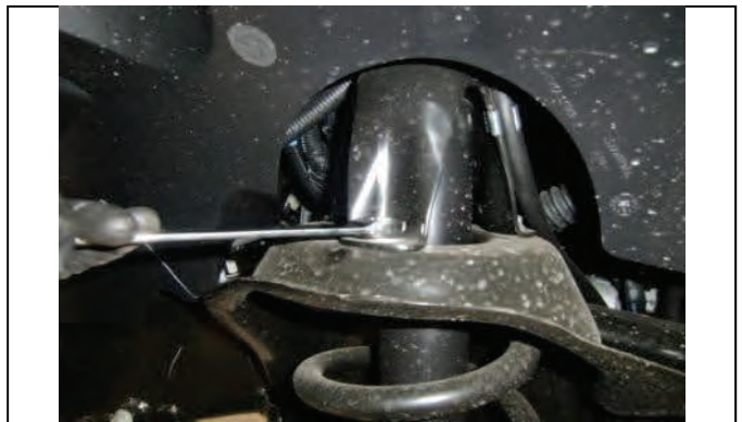
Loosen all (3) upper shock tower mounting nuts. Leave on.