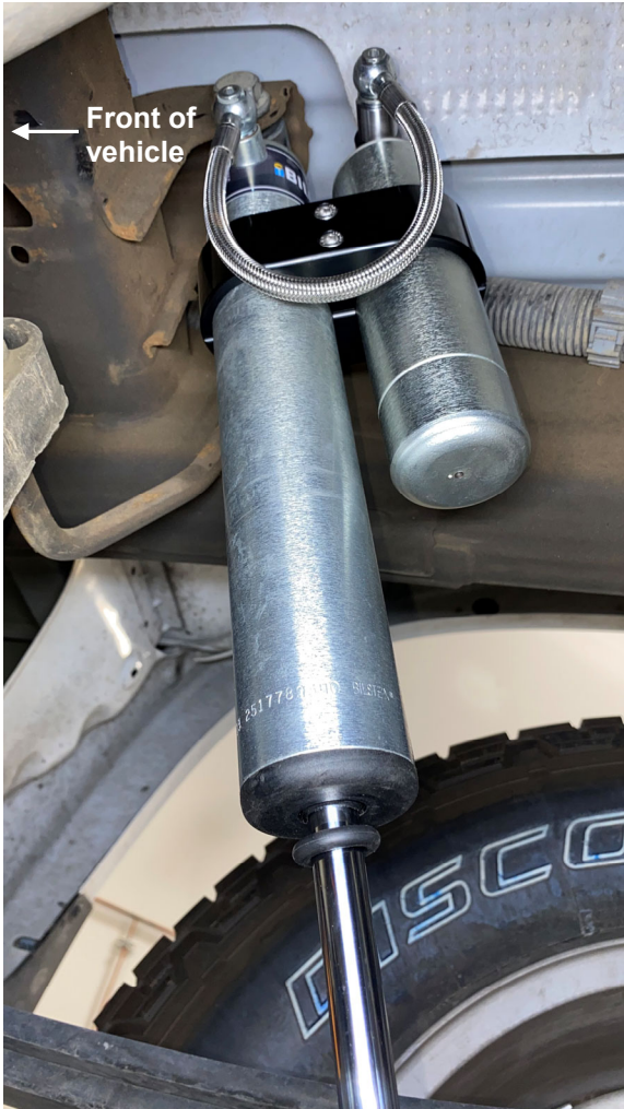
Figure 3. Passenger Side