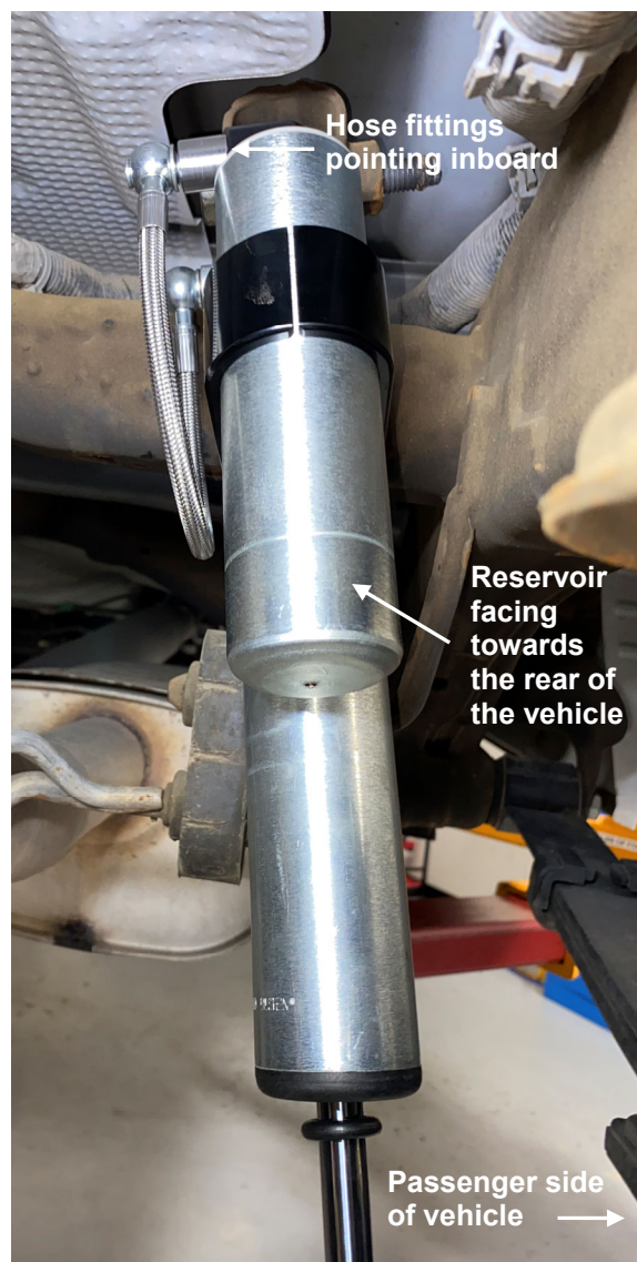
Figure 6. Passenger Side (Rear View)