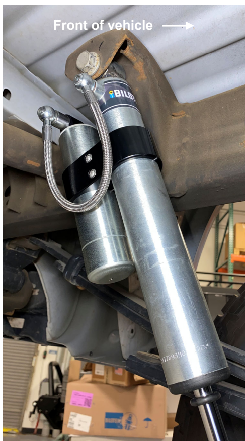
Figure 1. Driver Side