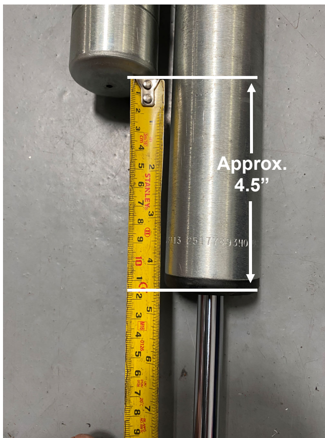
Figure 2. Driver Side