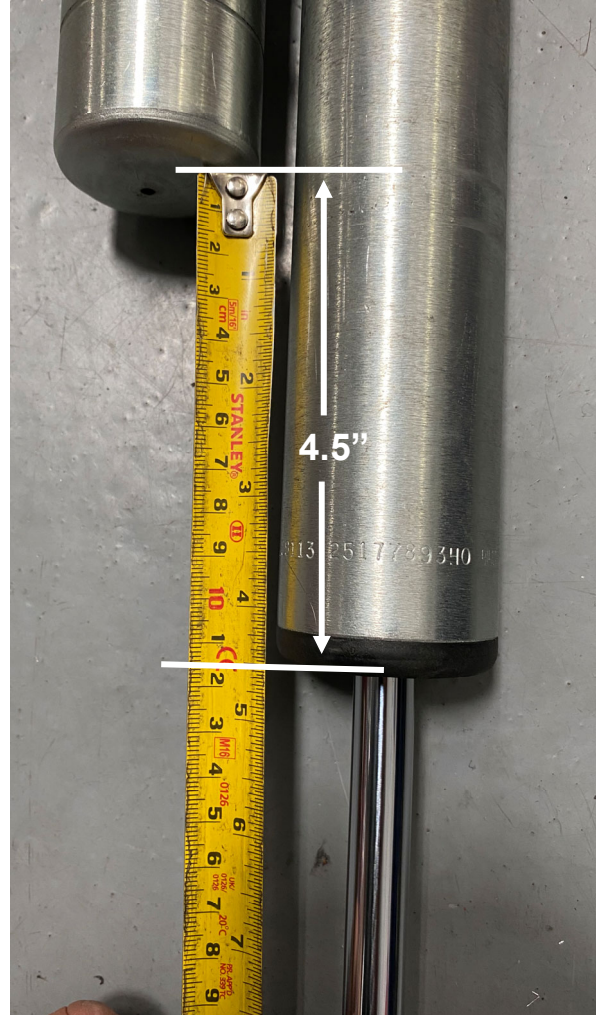
Figure 4. Passenger Side